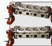
Dual axis rollover fixture